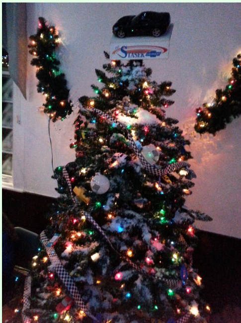
The Stasek Tree